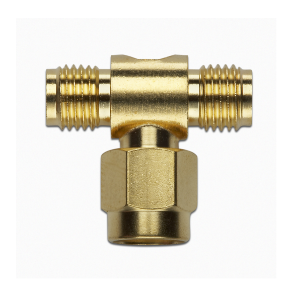
Model 72969 SMA T TYPE, JACK (F) / PLUG(M) / JACK (F)